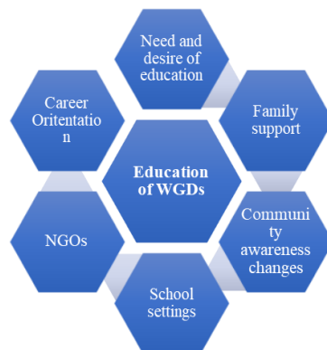
Figure 2. Factors affected opportunities for higher education and vocational training.

The results of the case study analysis showed that there were several prospects for WGDs to pursue their higher education and vocational training. Though the three case studies were suffering from discrimination and stigma in various ways with different levels, there were some opportunities for them to engage in schooling and career guidance as follows: